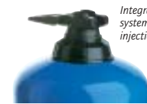
Integrated by-pass : system of turning concentrate injection on and off.

These options allow adapting your Dosatron to your needs. Contact our technical service to help determine what option you may need.